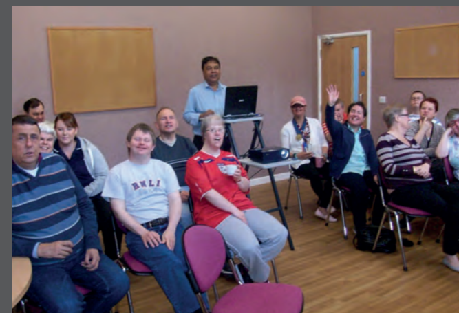
Clients receiving training at a Switched On for Learning training site.

The project will provide a comprehensive service to clients via a one stop shop approach, regarding income maximisation and energy information, advice and practical support, budgeting and money advice.