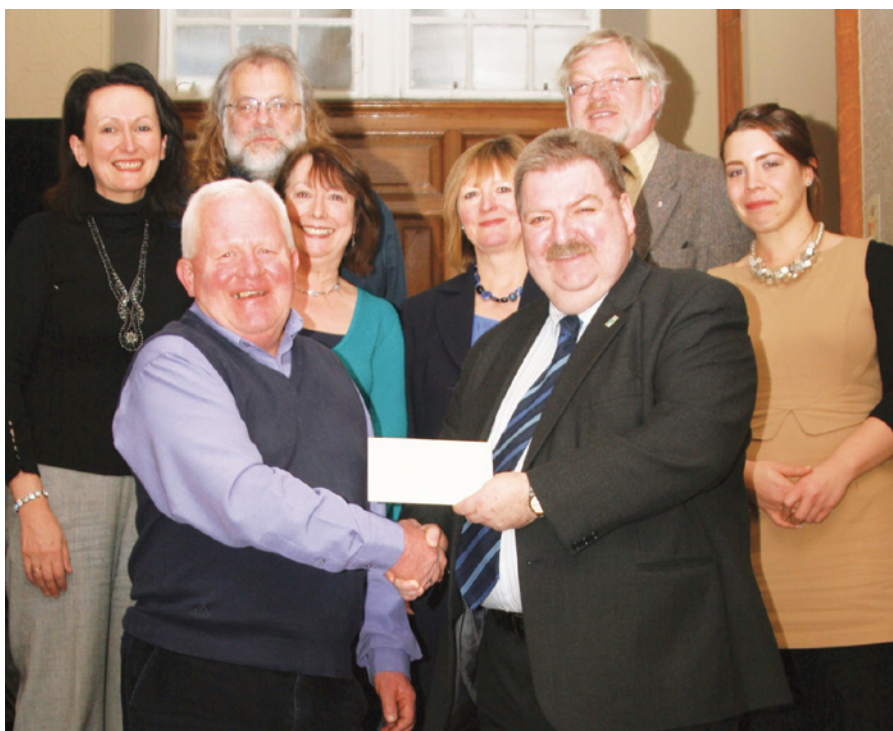
The Trustees are pictured at a 2010 meeting.