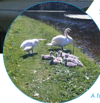
A family of swans have made Blackburn their home

Long-term actions will include managing a copse of trees to the south of the site to improve its structure for animals and plants. Blackburn Mill is also a 'silver' corporate member of LWT.